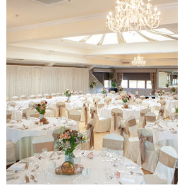
PRIVATE DINING IN THE OAK ROOM OR SHANNON SUITE

Please dial 0 for reception to enquire about our group menus